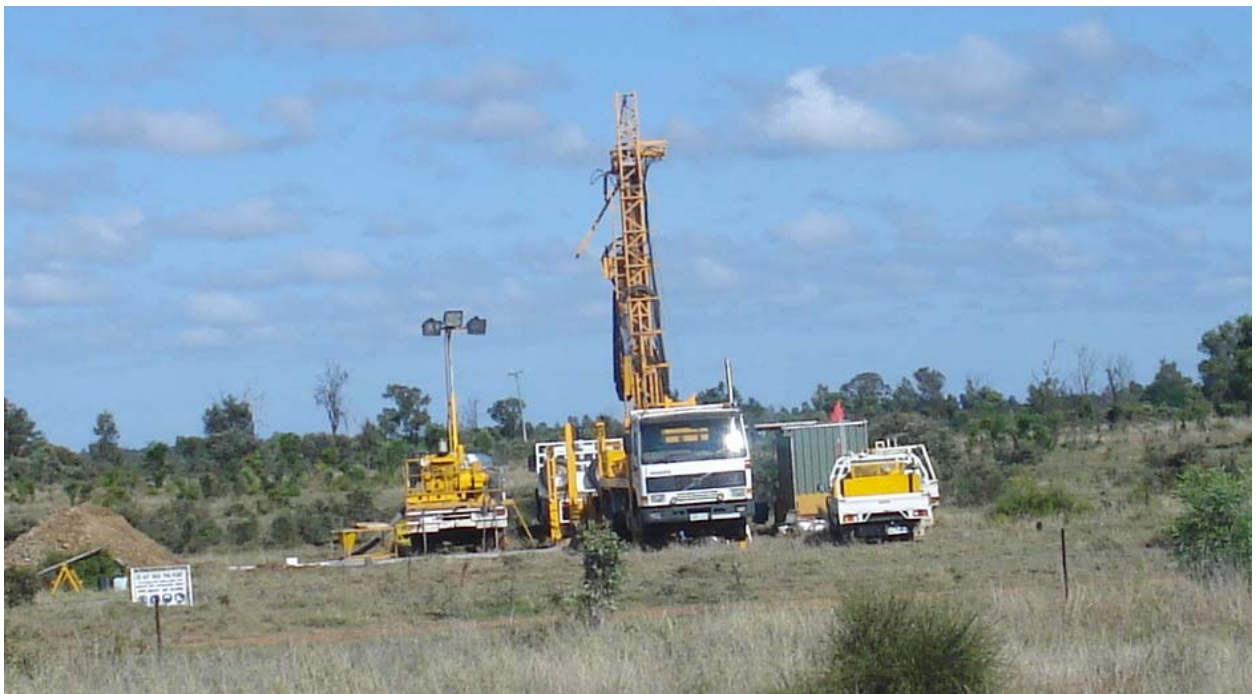
Linc Energy drill rig operation on the Emerald (Teresa) Tenements