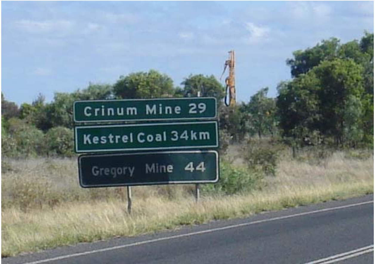
Mining operations in the vicinity of Linc Energy's Emerald (Teresa) Tenements